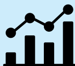
BI & Analytics